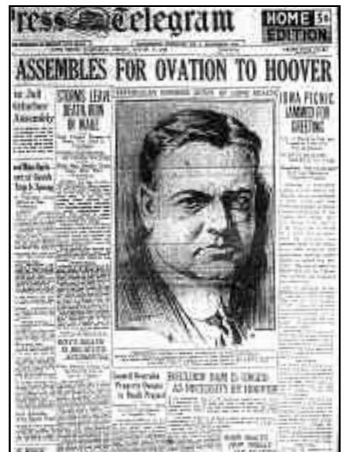
A newspaper account of the event ran August 17, 1928

Imagine voting for President of the United States and never knowing what the candidates looked like or being able to hear their voices. Presidential candidate Herbert Hoover solved that problem when on August 17, 1928, he spoke to a crowd of over 5,000 at the Bixby Park Speakers Stand. To quote an article in the Press Telegram of that day: "Following a tremendous ovation at City