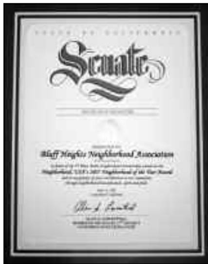
Congratulations from our State Senator, Alan Lowenthal