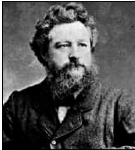
Renaissance man, William Morris (1834-1896)

popular in the North East from whence my parents came. Dad was a playwright so there were lots of bookcases in our home and old periodicals were strewn about. In all the homes I've experienced