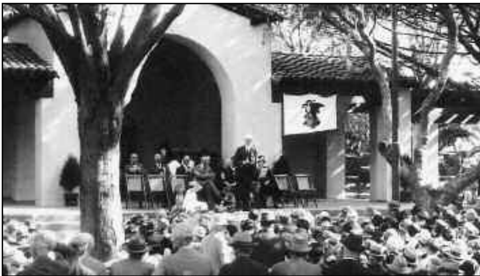
This archive photo shows the halcyon days of the Bixby Park Speakers Stand