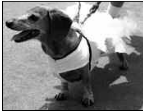
Angelic dogs strut their stuff