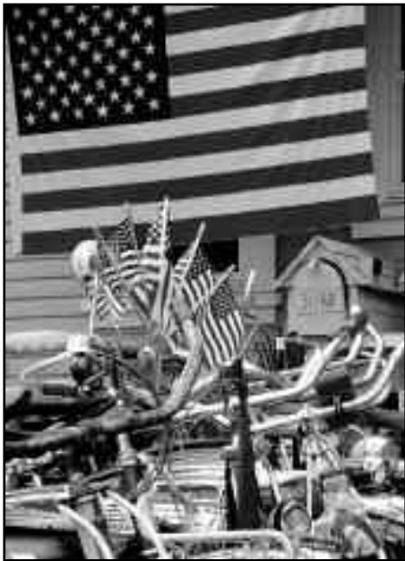
The bike show and old glory on a perfect day in the sun