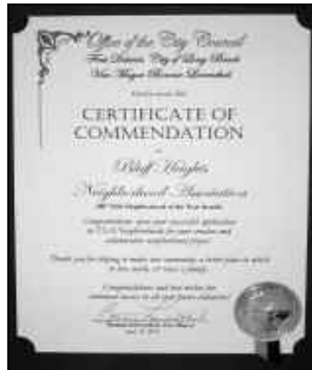
The Certificate of Commendation from the Vice Mayor

Please remember to attend the next Neighborhood Forum on Thursday, September 20th! ♦