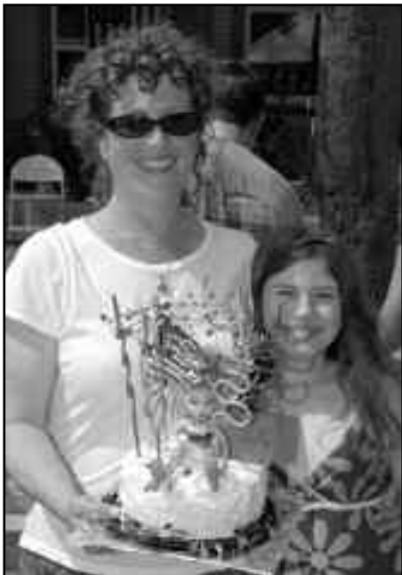
Well that takes the cake! (Cake Walk participants)