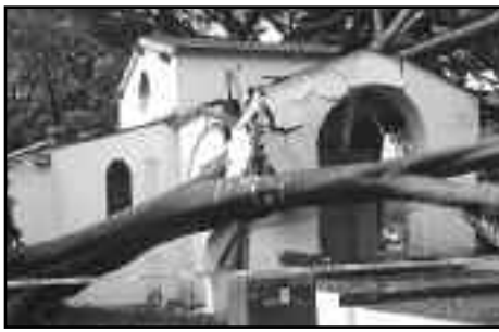
The Bixby Park Band Shell suffered major damage in 2005 and cost estimates for the restoration.

The delay is now in obtaining the necessary assessment of significance required to obtain federal funding, as per the National Historical Preservation Act, to assist with the cost of the restoration. An outside consultant has been hired by the city to provide this documentation. Once the building has been identified as eligible for national recognition, the approval process will begin. This is not to be confused with city landmark status which is not required to receive the funding. After this report is completed, there will be many levels of approval and hurdles to overcome including ADA considerations, environmental impact and approval from the State Historic Preservation Office.