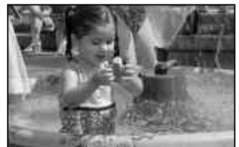
Fountain of joy: one cool customer