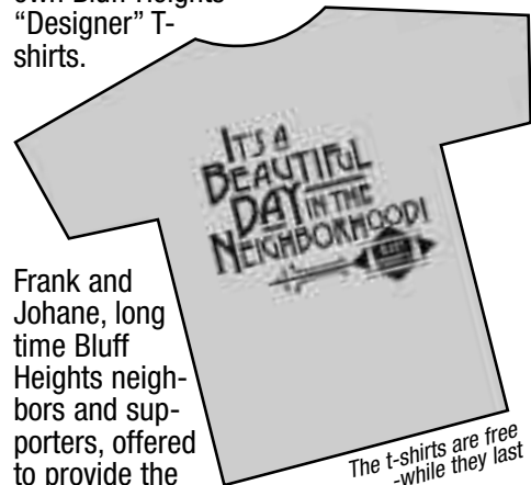
The t-shirts are free -while they last