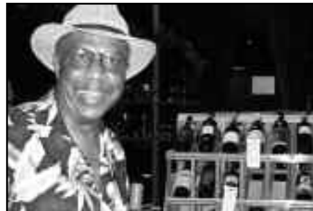
Decisions, decisions...a cab or a merlot?