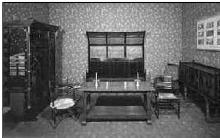
This interior was designed by British artist William Morris and his associates around 1860