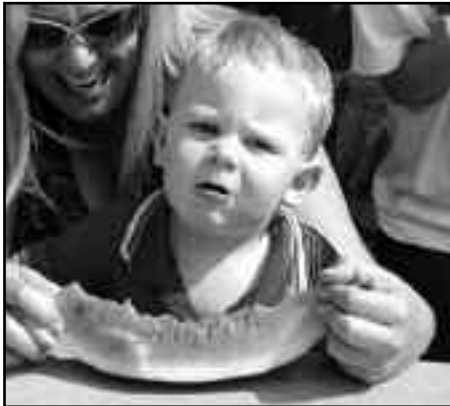
"Mom, no more watermelon!"