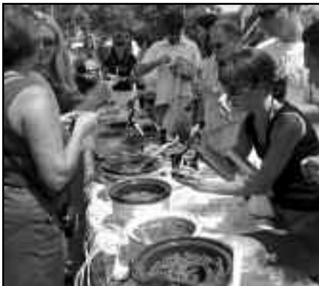
The popular chili contest and it's discerning judges