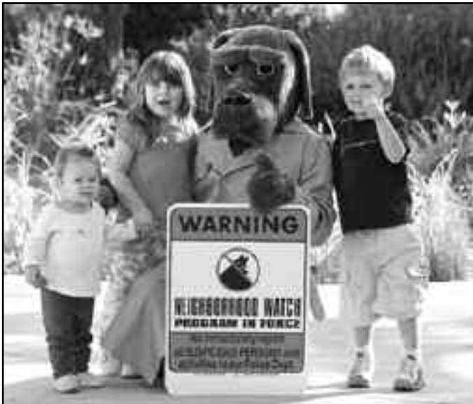
McGruff the Crime Dog wants to take a bite out of crime

All telephone numbers are area code (562) unless otherwise listed.