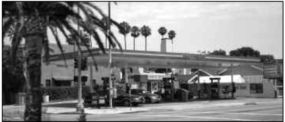
Ocean Gas is an example of a business that cares about how it fits into an historic district

The Board and area residents are proud of our neighborhood businesses and always seek to build and sustain positive relationships with them. This ongoing success story is yet another example that with simple conversation, patience and a friendly "neighborly" philosophy, we can achieve great things and enhance relationships with our friends and neighbors and business partners! ♦