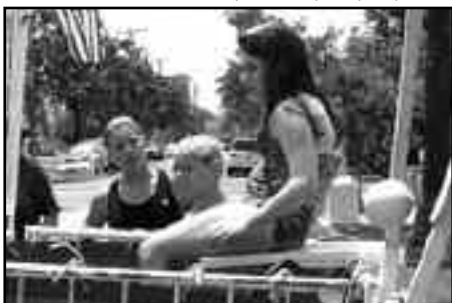
To dunk or not to dunk, that is the question... OKAY, DUNK HER!

New this year was the vintage car show displaying classic vehicles of yesteryear. After the door prizes had all been awarded the neighborhood prepared for the firework show over the majestic Queen Mary as seen from our bluffs.