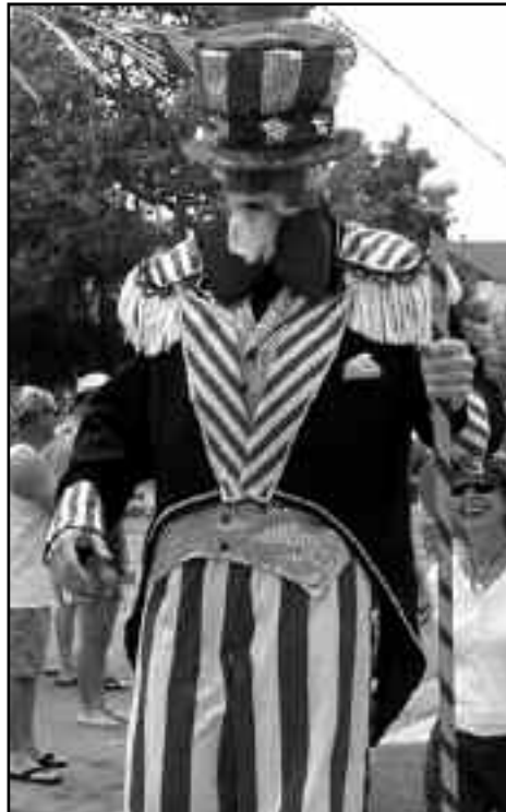
Uncle Sam leads the Patriotic Pooch and Pram Parade