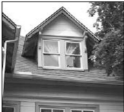
"Eyes are the window to the soul," windows give your home it's soul

When planning to remodel or restore an older home there are many issues to address. Questions as to what to do with deteriorating wooden windows are often a major subject for discussion and decision. Whether the home be a Bungalow, Spanish Revival, Tudor Revival, Victorian, or Neo-