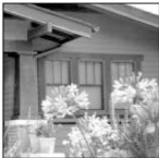
A Bluff Heights home's window's add that curb-appeal

Windows in a Bungalow style home are an important feature rooted in the philosophy of the Arts and Crafts movement of the early 19th Century. Harmony with nature was a primary focus in the Bungalow design and the use of extensive windows