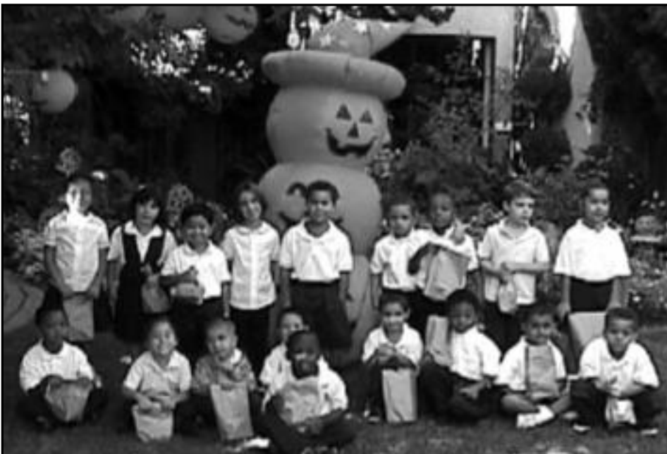
Horace Mann Students enjoy a Halloween treat