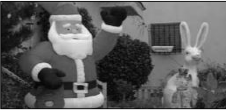
This past holiday season our "bunny on third street" had some company