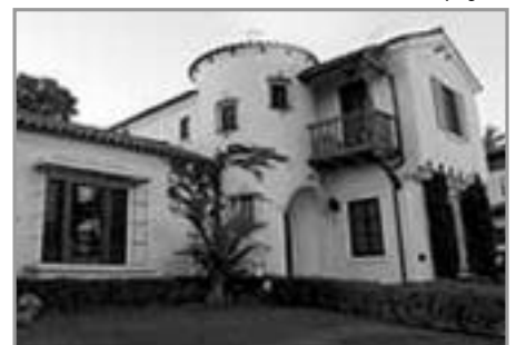
Classic Spanish Revival on Obispo